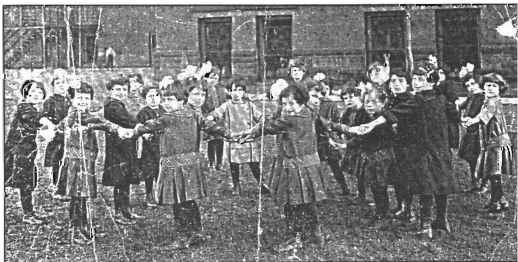
Cleveland Jewish Orphan Asylum Girls at Play