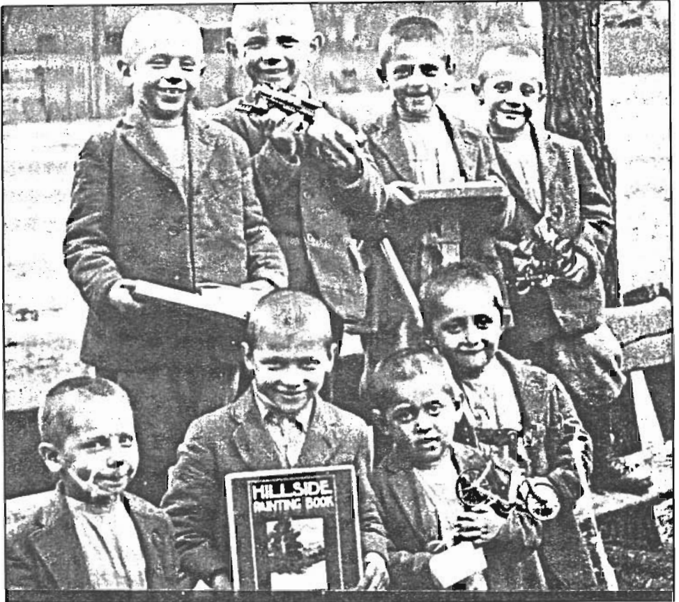
Cleveland Jewish Orphan Asylum Boys